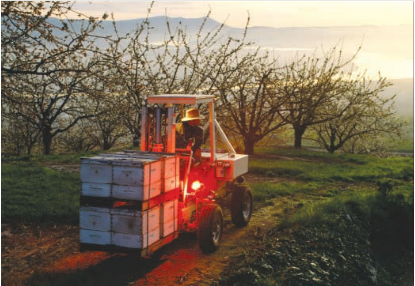
Honey bee hives are moved to orchards such as this cherry orchard by truck. The hives are then unloaded to the exact location specified by the grower.

Unlike people in other countries of the world, consumers in the United States enjoy delicious, nutritious and affordable agricultural products year-round. America's farmers feed more and more people each year while using less land to do so.