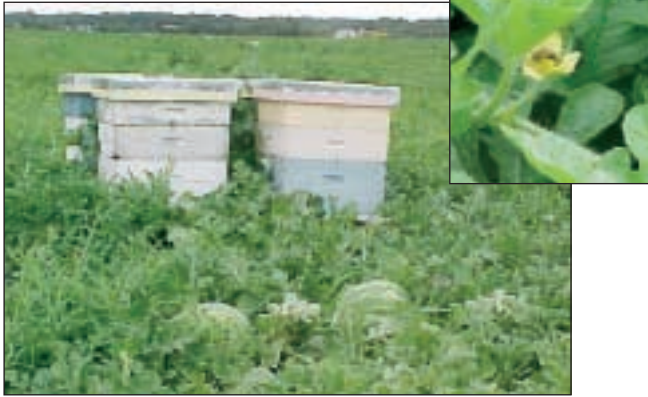
Watermelon blossoms must be cross-pollinated to produce fruit.

California produces more than half of the world's almonds. Without honey bee pollination, the almond crop would be extremely limited.