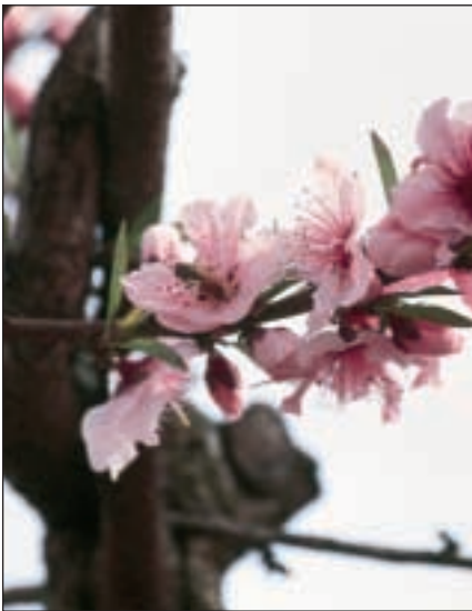
A honey bee visits a peach blossom. Pollination must occur for the blossom to produce a healthy fruit.