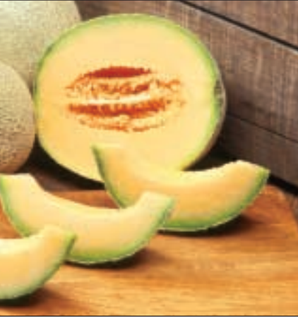
An estimated 300,000 colonies of honey bees are rented each year to pollinate melons.

“A healthy beekeeping industry is critical to both agriculture and the environment — without honey bees, our food supply would be significantly reduced.”