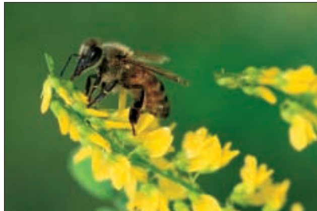
Clover is the most common floral source of honey produced in the United States.