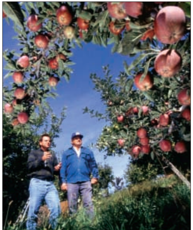
The quality and quantity of apples increase with pollination.

A healthy beekeeping industry is vitally important to a healthy agricultural economy, to wildlife habitat, to a healthy environment — and to the plants in your own backyard!