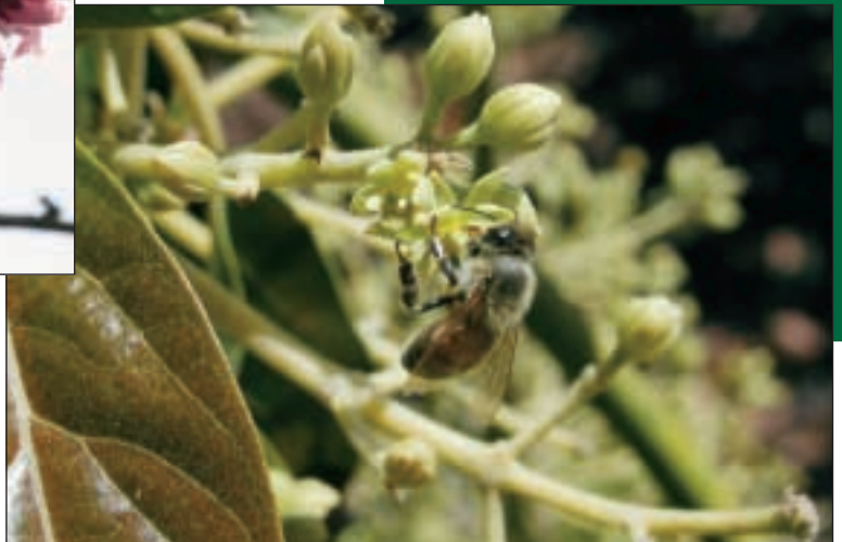
As the worker bee visits the avocado blossom, the pollen clings to her hairy body and is thereby transferred from blossom to blossom.